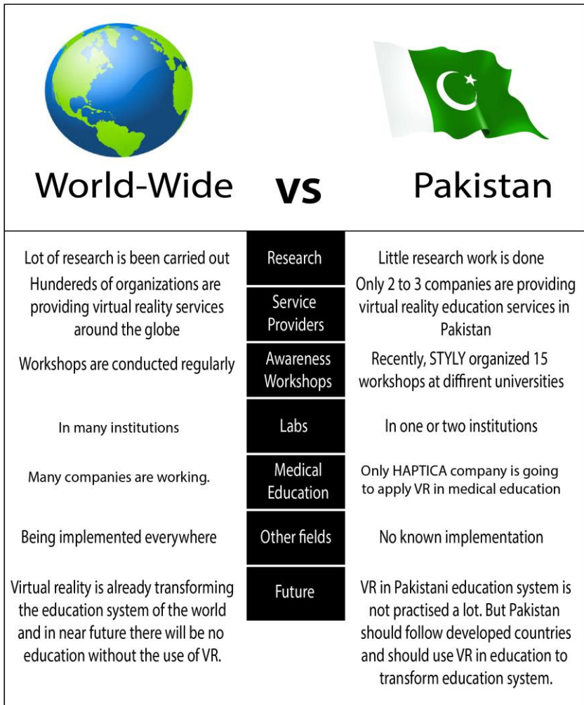
Figure 2) Comparison of virtual reality use in education

Virtual reality technology is revolutionising the world educational systems. Teacher can now more easily teach complex concepts, and students can learn in advanced ways. There is very little role of virtual reality in Pakistan’s educational institutions at present. The following figure-2 shows a comparison of virtual reality use in Pakistan and all around the world.